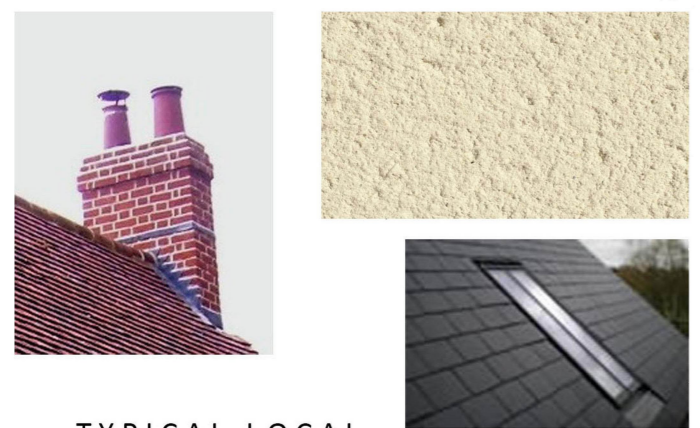
TYPICAL LOCAL MATERIALS & DETAILS