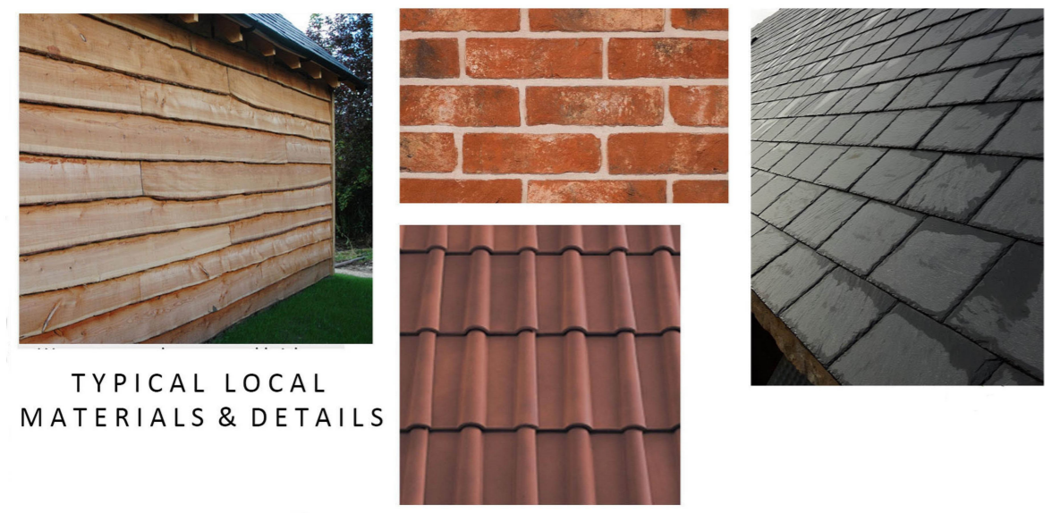
TYPICAL LOCAL MATERIALS & DETAILS

The application site is within the Poulshot Conservation Area and, as such proposals should preserve or enhance the character, appearance and setting of the conservation area, having regard to aspects of special interest and significance.